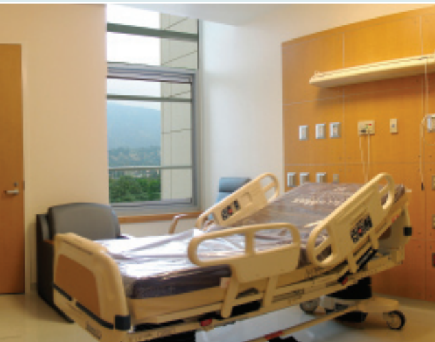
Theris brings cost-effective ventilation reliability and energy efficiency to all hospital spaces.