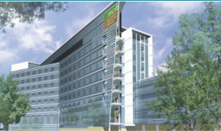
Northwest Community Hospital