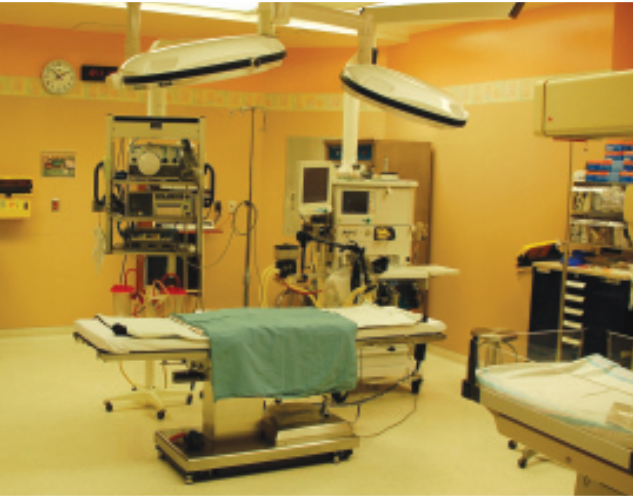
Using Theris in operating rooms, surgeons are comfortable, rooms are pressurized, and energy use is minimized.